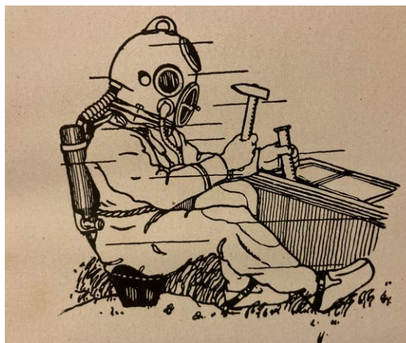
Figure 5: Classic diver working

Periodically and in accordance with preventive planning, the company will carry out inspection visits to the facilities and equipment to detect unsafe conditions or unsafe acts that may result in harm to people. These will be carried out by groups that will control the implementation of the corrective and preventive actions proposed in previous inspections. A rigorous and systematic monitoring of corrective and preventive measures will be carried out, as well as repetitive anomalies to identify causes and critical points of the company and eliminate them satisfactorily [2].