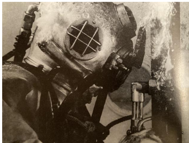
Figure 1: Classic diver in underwater cutting operations

The Table 2 shows the specific risks in the underwater cutting and and welding operations, as well as their potential effects on the diver's body and the preventive measures necessary to alleviate said effects.