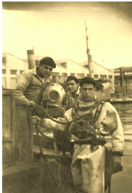
Figure 4: Classic diver before doing a job

In underwater cutting and welding work, the corresponding operating instructions must be available that specify who must carry out the task, what it consists of and how it must be executed, when and with what expected result. There will always be a boat on the surface to help and assist divers during their dives. The boat's crew will monitor the bubbles coming from the divers' respiratory equipment at all times and will be informed, as far as possible, of the approximate duration of the dive. The crew of the boat will be alerted to pick up a diver who comes to the surface with any problem in the shortest possible time [2]. In figure 4, The classic diver, with his team of diving assistants prior to carrying out a dive.