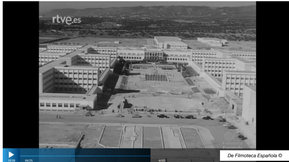
Image 5: Onésimo Redondo Labor University (Córdoba).

year it hosted just 560 students, although this number increased to 1,370 five years after its opening. The Labor University of Zaragoza had a capacity for 4,000 students, although in its first year only 650 boys were enrolled (Noticiero n. ° 724B, 19/11/1956).