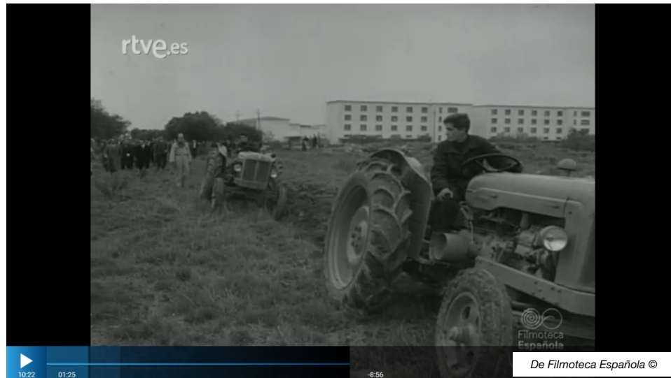
Image 2: Students from the Francisco Franco Labor University in Tarragona in a tractor driver training course.