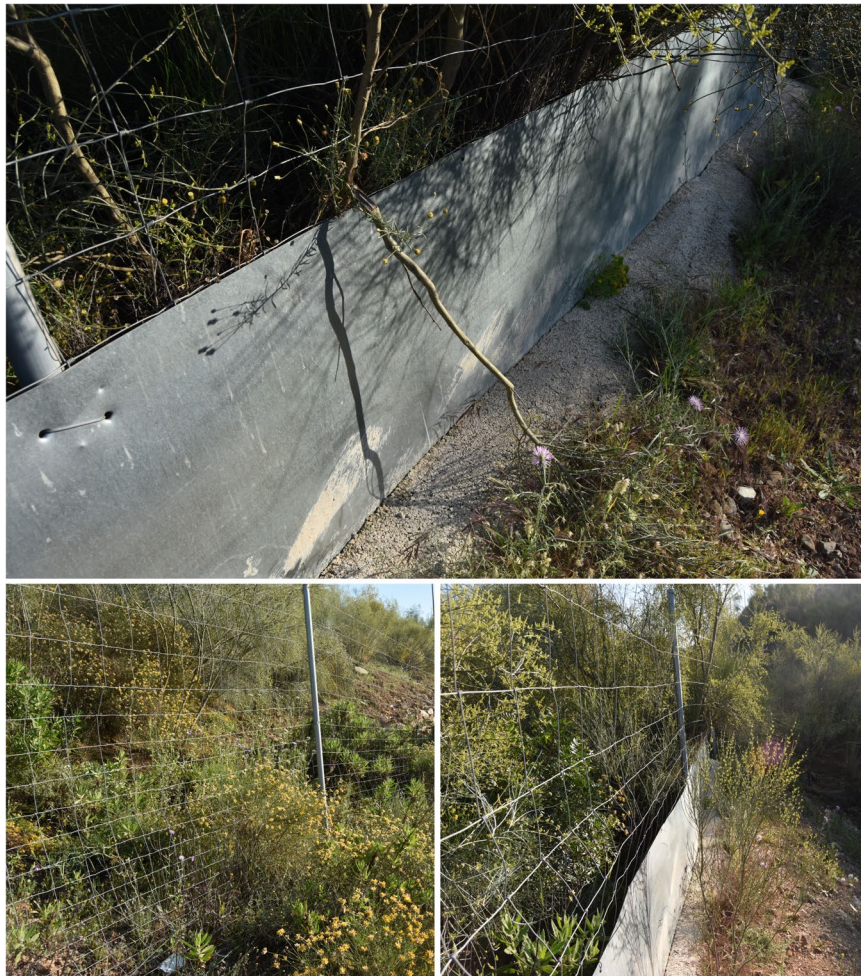
Figure 2. Top image: reptile fence. Left image: chain link fence without metal sheet. Right image: reptile fence with vegetation around it.

species is found only within a small distribution range in southern Spain and Portugal. Although the species may have been introduced to Iberian Peninsula from northern Africa in prehistoric or and historical times 23 , since the Spanish populations are morphologically indistinguishable from those of northern Africa 24 , individuals of the species are not allowed to be killed nor their breeding sites or resting places disturbed. The common chameleon is included in Annex IV of the EU Habitat and Species Directive (92/43/CE) as a species of interest and is strictly protected in Annex II of the Bern Convention. In Spain, mortality caused by collision with vehicles is one of the main threats to the species 25–27 .