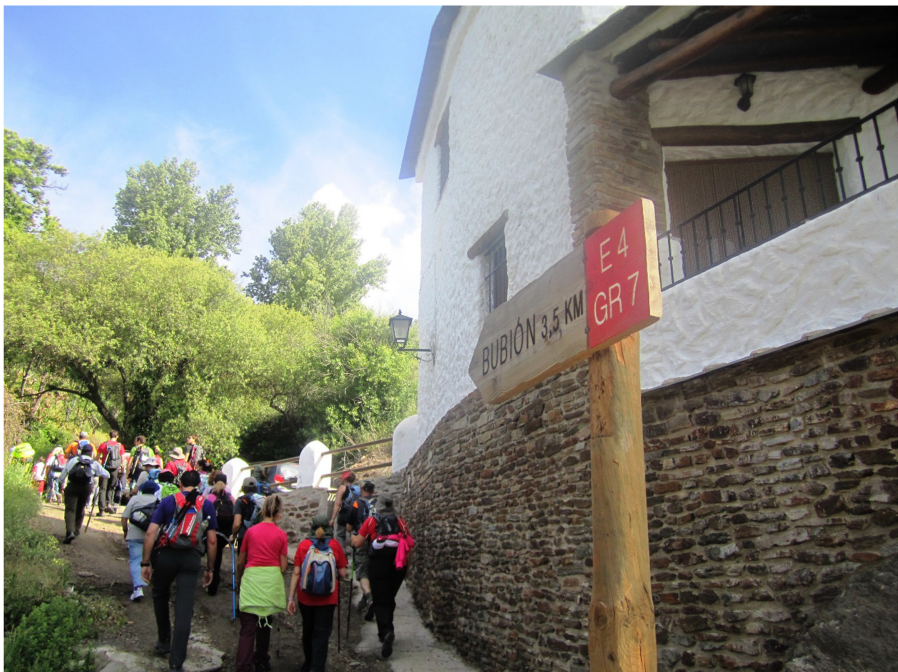
Plate 1. Group of hikers crossing a town along a marked path in the Alpujarra (Granada)