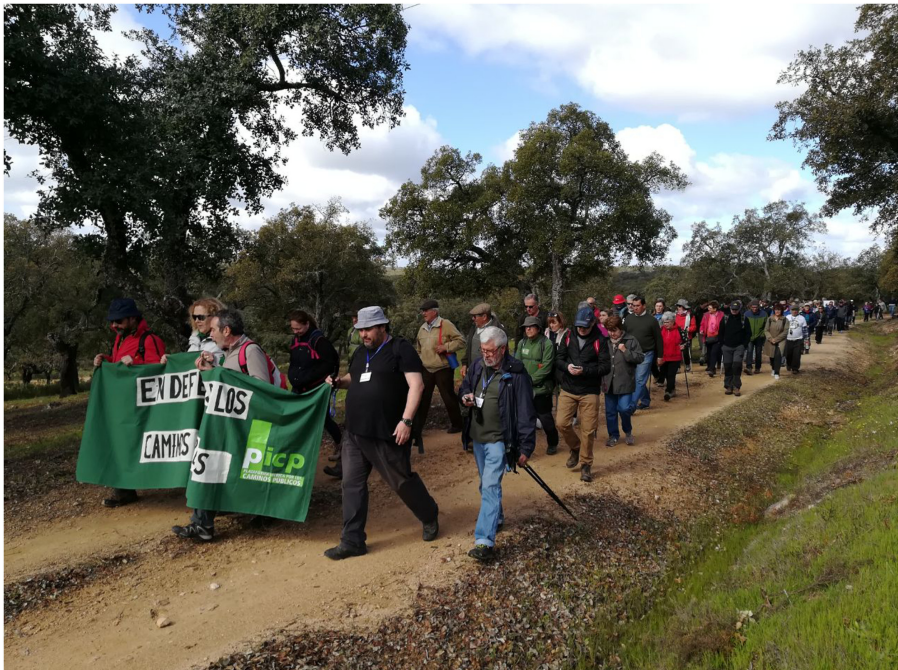
Plate 2. Group of hikers during a protest March in defense of public paths

The research team behind this study defends the idea that rural life needs to be academically reviewed anew, given that the changes experienced in the last 2 decades have been very significant. The review needs to be twofold. First, from the perspective of governance, to determine the actors who are currently involved in establishing the symbolic and material value of rural resources, and how new norms (formal and informal) emerge from this. In this regard, the representation of interests model needs to be reviewed in order to