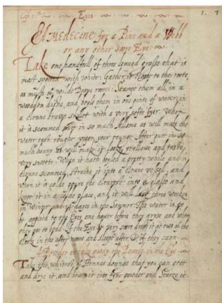
Figure 1. Page 1 of W213 ix

In Figure 1, which shows the first page of W213 with recipes, some of the aspects discussed so far, such as ruling, pagination and hand, can be noticed.