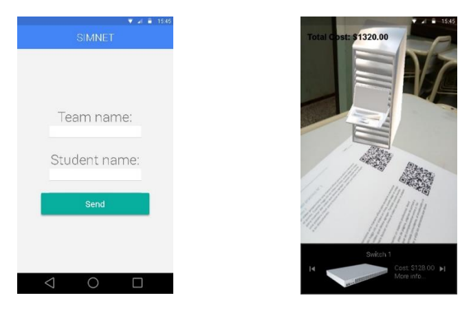
Fig. 2. a) Screenshot of the application main screen; b) Screenshot of the application in use.

Once the student achieves a possible solution to the problem. The application notifies them that a possible solution was found.