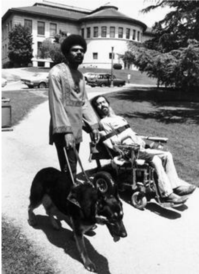
Rolling Quads --Ed Roberts with one of the revolutionary brothers, Berkeley, California – late 1960s