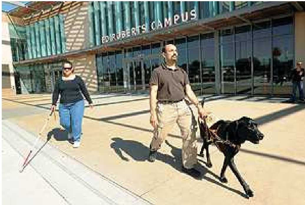
The Ed Roberts Campus