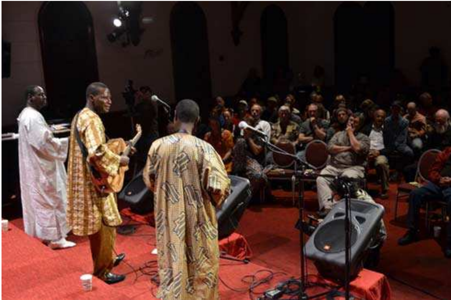
The Sanctuary's performance space