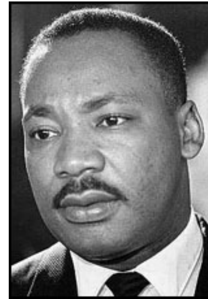
Martin Luther King