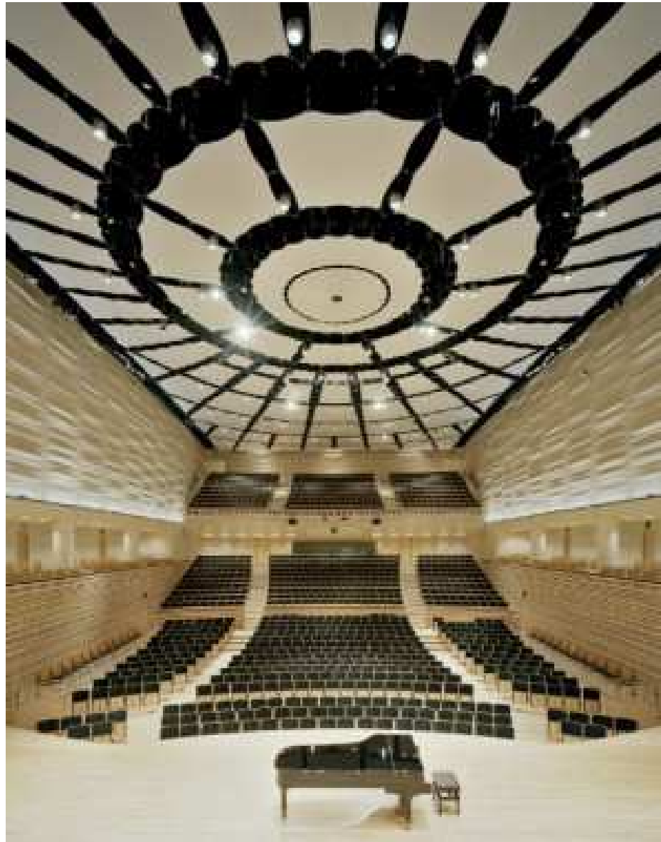
EMPAC: sonically isolated auditorium