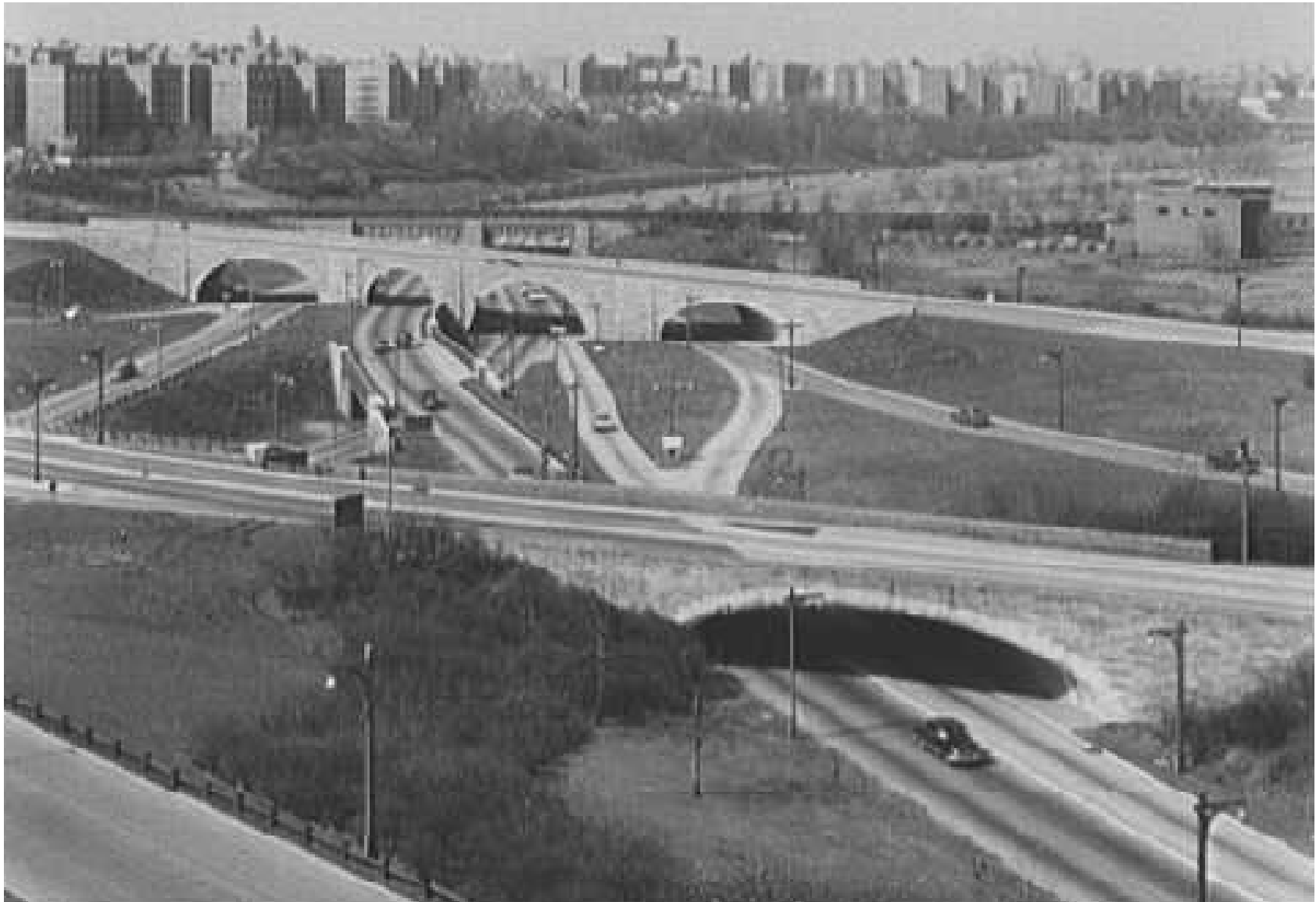
Long Island Expressway, early 1940s