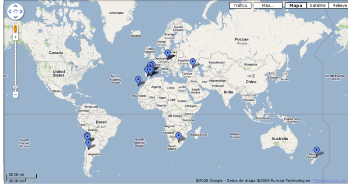
Figure 1. Geographic location of the GLORIA telescopes.

The GLORIA network integrates 18 telescopes worldwide (Figure 1) that had been working in various scientific fields and dissemination issues, creating a heterogeneous network where telescopes time is shared between owners and the GLORIA network.