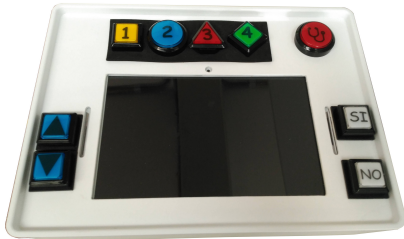
Fig. 3. Remote control used to interface the robot

allow collecting the results of the tests, including session recordings. Hence, all the configuration information and the results of the session travel through these channels.