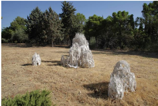
Fig. 6. Origin . Tessa Gill. 2018.

Finally, Tessa Gill’s work Origin tackles the problems of the environment from an inclusive perspective, as her work aims to take advantage of organic form to extract her own world, which she constructs by means of structured domes with parabolic linear lines. From this formal point of view, a certain parallelism could be established with Belén Ruiz’s work, but its intention is none other than the anthropological exploration of man’s need for the construction of niches-dome to serve as a shelter. Using such natural materials as esparto grass and plaster, her work is formally and conceptually integrated into the medium in which it is shown.