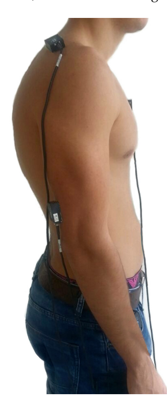
Figure 1. Inertial sensors' placement.

After recruitment, the participants attended the study at the Human Movement Laboratory, Faculty of Health Sciences (University of Málaga). Prior to attaching the sensors to the skin, inertial sensors were placed according to their body segment placement on a horizontal or vertical flat surface, so they were reset to zero using the InterSense Server software. Then, any body surfaces were cleaned with alcohol for better adhesion to the skin. Their placement was the pathological hemibody of each subject located on the middle third of the humerus, slightly posterior with the Z axis pointing away from the body, on the middle third of the upper spine of the scapula with the X axis aligned with the cranial edge of the scapular spine and on the flat part of the sternum, with the Z axis pointing away from the body (Figure 1) according to the protocol stablished by Cutti et al., whose validity and reliability have been stablished, having high accuracy and being highly correlated to the gold-standard optoelectronic system [9]. Fixation was ensured using double-sided adhesive tape attached to the patient's skin to prevent slippage in flat areas. In cylindrical body segments, an adhesive bandage 5 cm wide (Strappal<sup>®</sup>) was used (Figure 1).