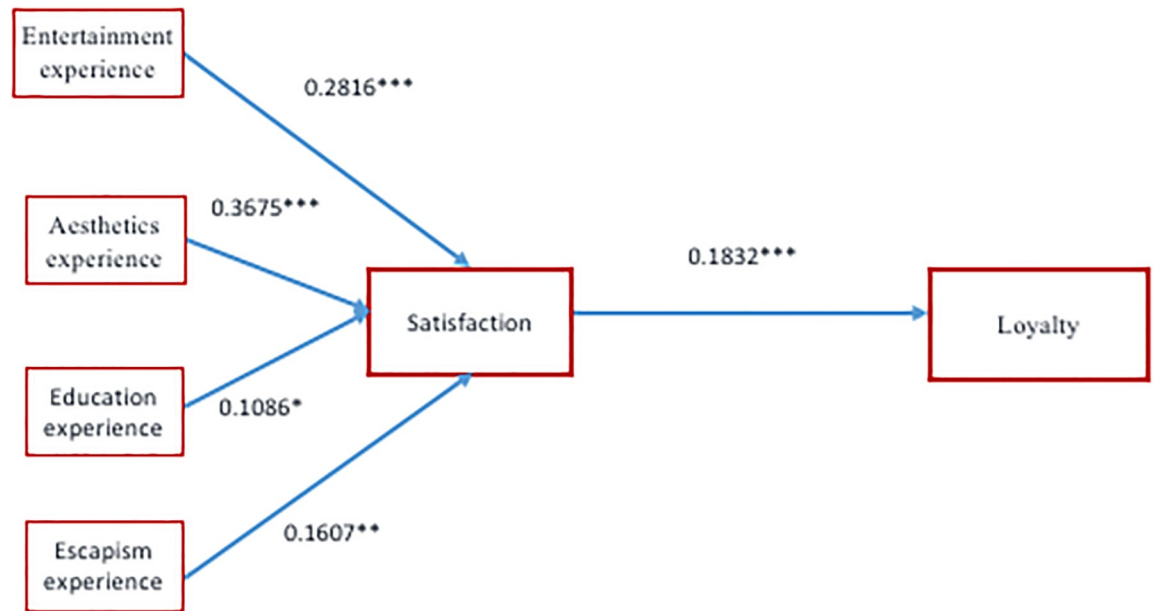
Fig 2. Structural model results.

https://doi.org/10.1371/journal.pone.0246562.g002