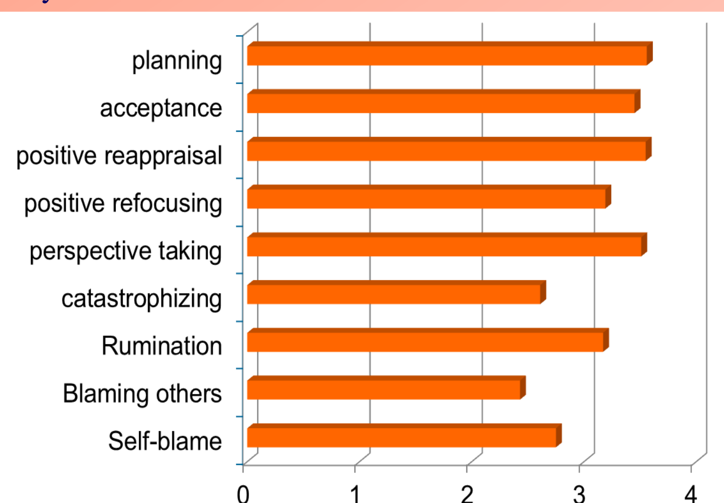
Figure 1. Use of different cognitive coping strategies by women

As shown in Figure 1, the results showed that the main strategies used by women are planning, positive reappraisal perspective taking and acceptance, being the least used catastrophizing and blaming others.