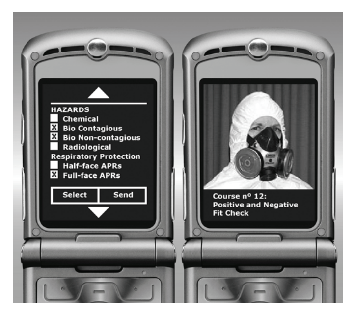
Figure 2. Cell phone displaying a multimedia message.

Information in the JITTER is organized into three components: (1) Emergency Information, (2) Emergency Training, and (3) Authentication. The Emergency Information component contains real-time information unique to the emergency. The Emergency Training component consists of easily assimilated multimedia training modules on important occupational and safety issues related to the agent(s) involved in the emergency incident. The Authentication component contains a minimal (three column) profile of EMP, with names and associated cell phone numbers and training.