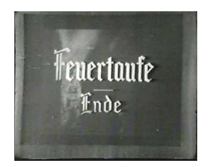
Fig. 18 Fig. 19

The images following the initial title provide a summary of the stages of the Blitzkrieg designed by the Germans: the initial air force attack aimed at neutralizing the enemies' principal communication channels, means of transport and centers of industrial production; then parachutists sent behind enemy lines to sabotage the broadcasting stations, mainly radio; following that, the deployment of panzers and the motorized army, which entered enemy territory at great speed; and finally, the advance of the infantry, which was to finish the work initiated by the other army units.