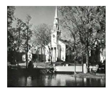
Fig. 28 Fig. 30 Fig. 29

The final cut of The Ramparts We Watch transports the audience from the First World War to the country's founding moment (in canonic terms). And then comes the reverse journey, via Plymouth Rock to the First World War, continuing on and demanding of the present generation, in the prewar context of the country at the time, a similar response to that of their ancestors.